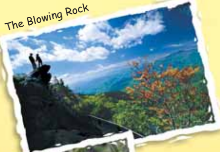
The Blowing Rock