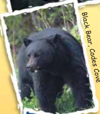
Black Bear, Cades Cove